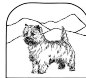
CAIRN TERRIER CLUB OF DENVER